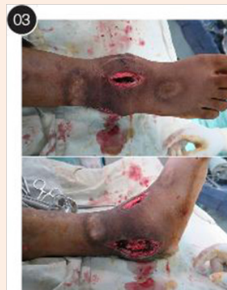
Figure 3: Anterior and lateral approach of the ankle.