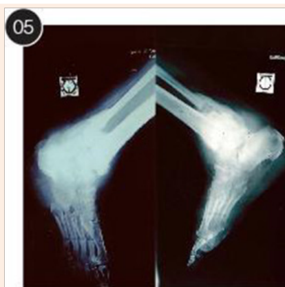
Figure 5: Final post-operative outcomes shows a well-aligned ankle arthrodesis and a plantigrade foot.