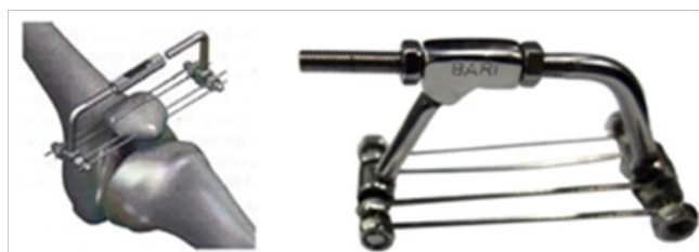
Figure 1 Compressive External Fixator.

from one another by turning the distraction nut until the tension wires are tight. The joint is ranged through flexion and extension while checking the stability of fixation by c-arm.